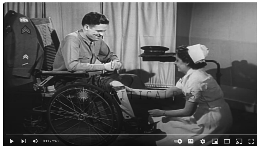
American families conserving and rationing in World War 2... HD Stock Footage