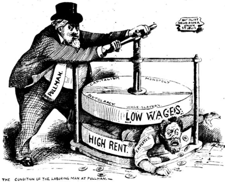
"The Condition of the Laboring Man at Pullman" (Chicago Labor Newspaper, 1894)